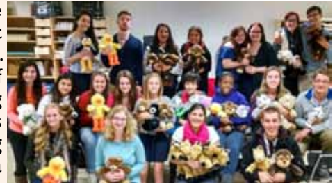
Cuthbertson SAVE club stuffed cuddly toys for Turning Point Domestic Violence Shelter of Union County (NC).

In a time full of sharing and giving, such as during the holidays, violence can be more devastating for its victims. By reaching out through service to our school and community, we can create a better environment for those who may not otherwise have a happy holiday season. SAVE emphasizes the importance of developing responsible citizens as a promising effort in preventing violence in our schools and communities. Youth should not only know their rights, but responsibilities in areas of the law, government, the Constitution, and in daily civic activities. It is difficult to emphasize to youth that they "should" be and feel a part of their community without providing opportunities to learn first-hand. Learning by doing is a key component of SAVE through service projects. Empowering students to get involved in hands-on efforts to prevent violence is a very rewarding learning experience of SAVE. SAVE is a way for youth to get involved!