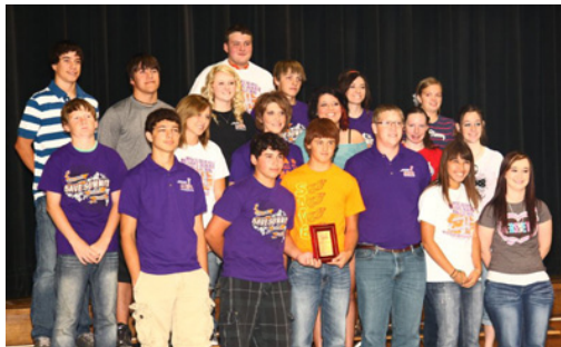
IRA HIGH SCHOOL SAVE IRA, TX